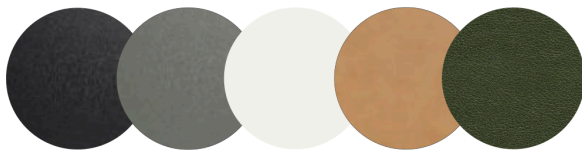
Black Grey Cream Tan Green