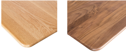
Solid American Oak Solid American Walnut

Wood is a natural material so each piece will be unique, telling a different story of the condition it grew in. There will be colour and grain variation.