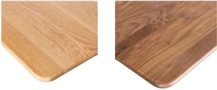
Solid American Oak

Wood is a natural material so each piece will be unique, telling a different story of the condition it grew in. There will be colour and grain variation.