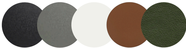
Black Grey Cream Tan Green