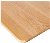
Solid American Oak

Wood is a natural material so each piece will be unique, telling a different story of the condition it grew in. There will be colour and grain variation.